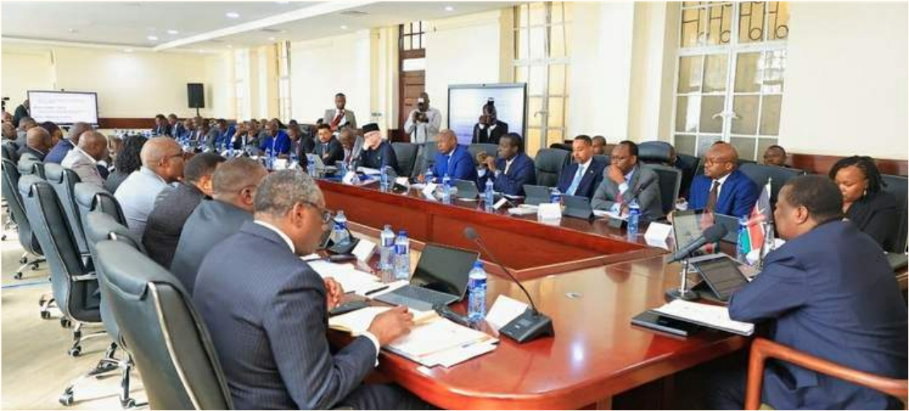
National Development Implementation Committee(NDIC) meeting in progress. cont. Pg 5.